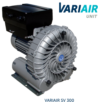
VARI AIR SV 300