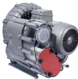
SV 300 including integrated suction filter and vacuum relief valve