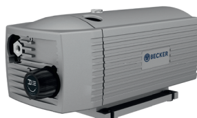
Pressure: DT and DX