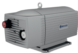
Vacuum: VT and VX